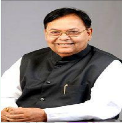
Dr. PATANGRAO KADAM Founder Bharati Vidyapeeth (Deemed to be University), Pune